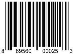
Orange Cream Frosting Body Pop